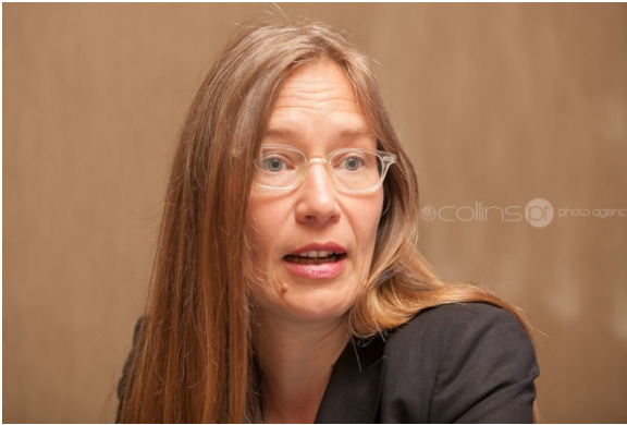
Hilikka Becker, Chairperson of the International Protection Appeals Tribunal (IPAT)