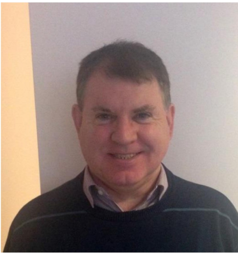
David Goggins, Refugee Documentation Centre